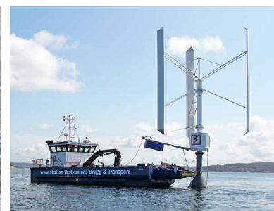
Top: Artist's rendition of SeaTwirl S2. Below: SeaTwirl S1, grid connected since 2015.